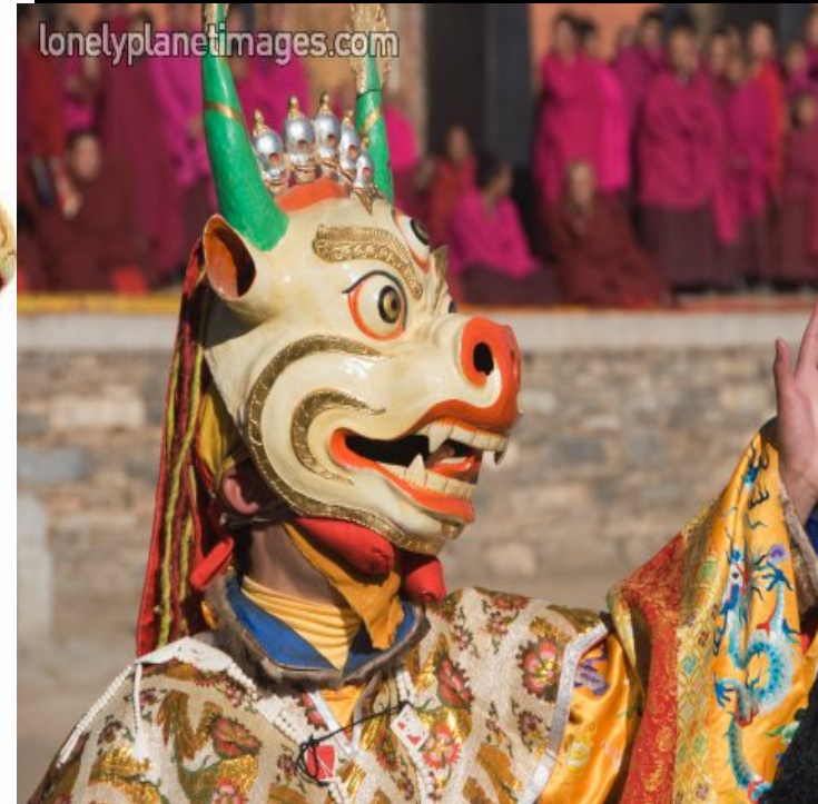
CHINESE MASK lonelyplanetimages.com