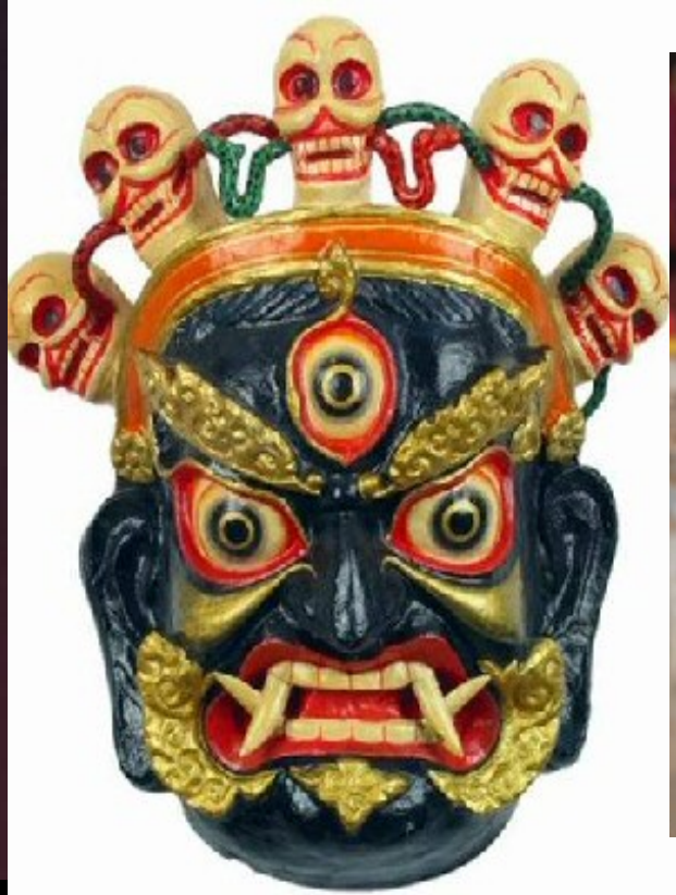
TIBETAN MASK