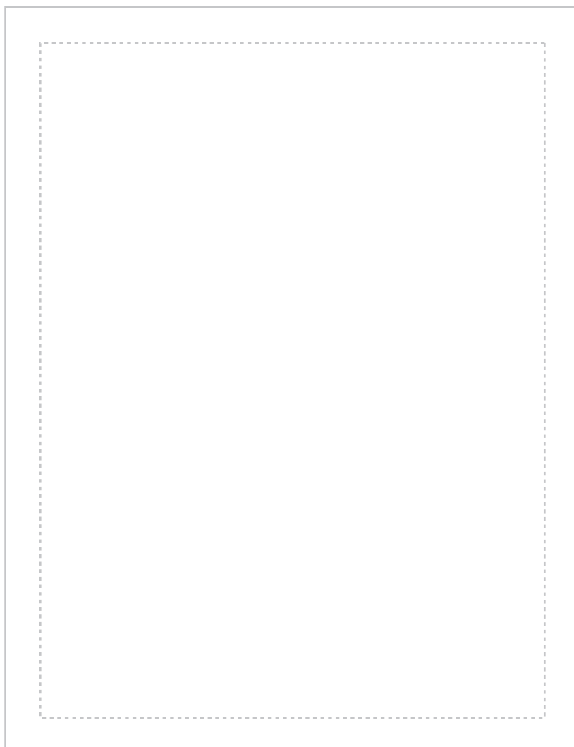
INSIDE (LEFT or TOP) / 5.5x4.25

All captions and important information must remain within the dashed line, or it risks being cut or cropped by the printer.